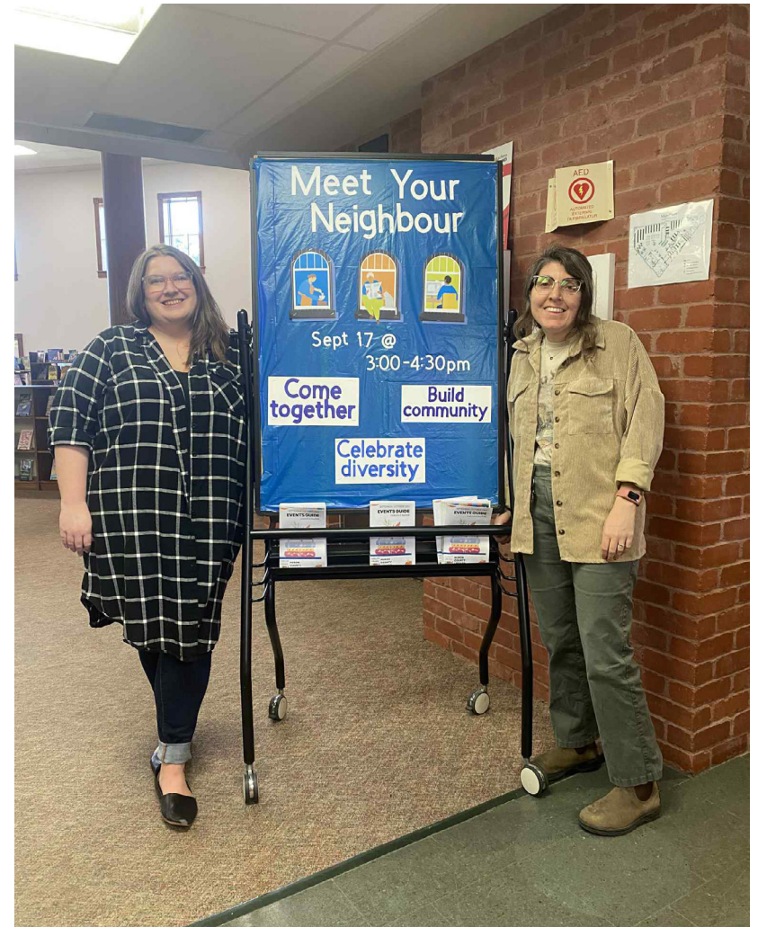
Promoting Meet Your Neighbour programs at Goderich Branch