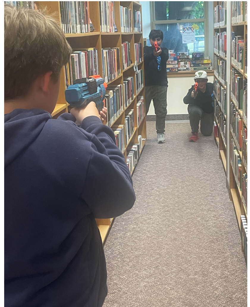
Nerf Night at Seaforth Branch.