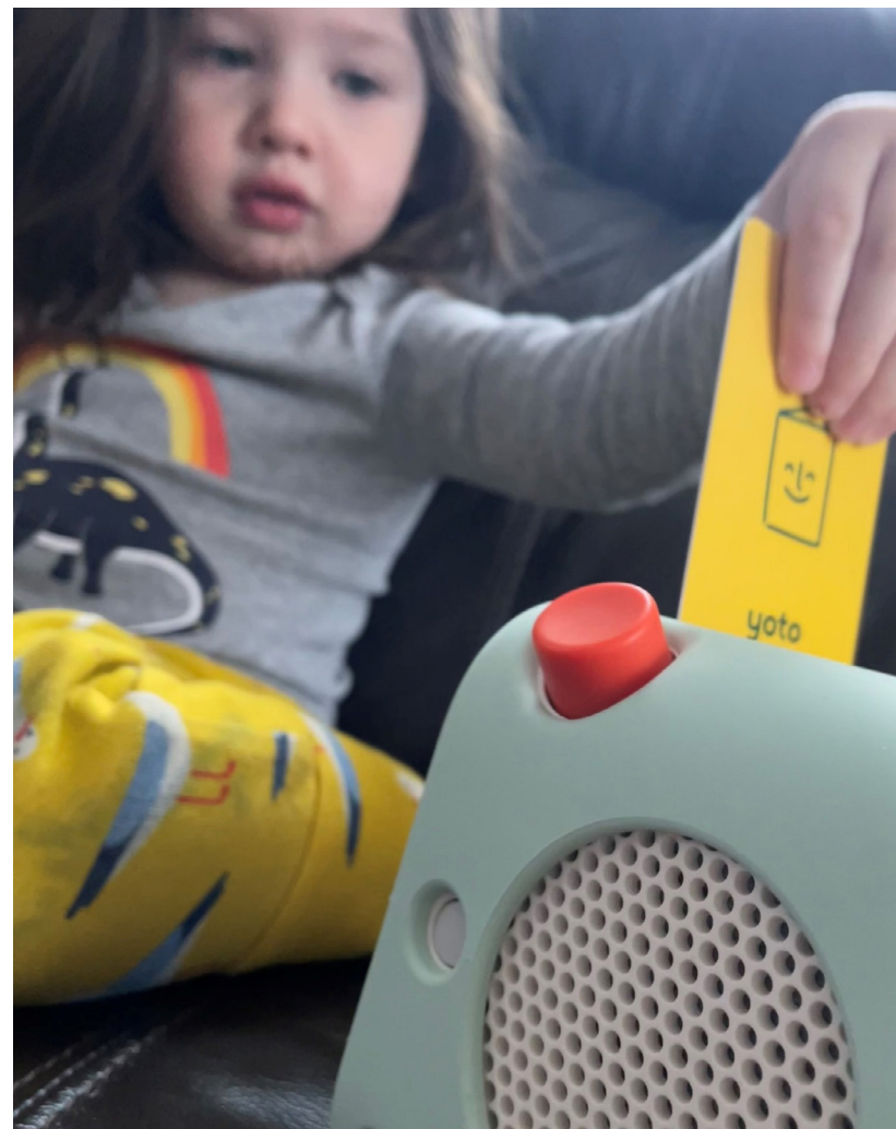
A young patron trying out the new Yoto player.