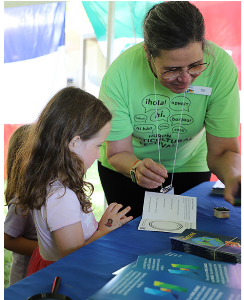
Library staff at the Huron Multicultural Festival