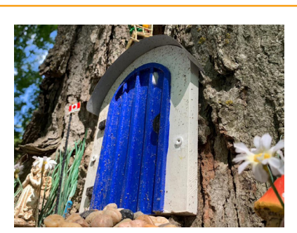
Fairy Door Trail 445 Turnberry St., Brussels O: What was your favourite fairy door along the trail?