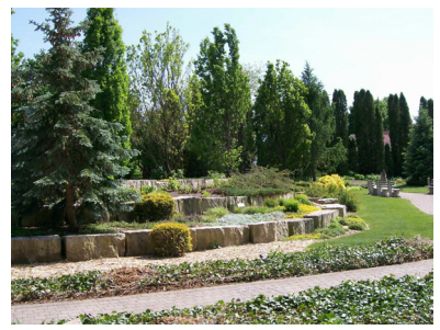
roaming in the park?

The Huron County Library and Ontario's West Coast have partnered to present a summer giveaway you don't want to miss! Explore the hidden gems found in your backyard for a chance to win a Huron County weekend get-away valued at over $1,400. Visit 10 or more of the hidden gems listed below, answering a question specific to each location. Answers can be found at each location and written beneath the pictures below. And don't forget to share photos of your journey across the County this summer! Tag @HuronCountyLibrary and @OntariosWestCoast on social media.