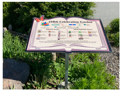
150th Celebration Garden 45088 Harriston Rd., Gorrie

Q: What is one native plant found in this garden?