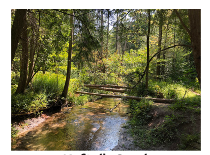
Naftel's Creek 79154 Bluewater Hwy., Goderich

Q: What is the trail surface a combination of?