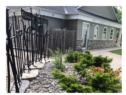
Reading Garden 18 Main St. N., Bayfield

Q: How many trees were planted on the Stevenson Tract from 1952 to 1966?