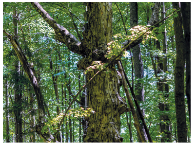
Stevenson Tract 41502 Morris Rd., Brussels

Q: How many trees were planted on the Stevenson Tract from 1952 to 1966?