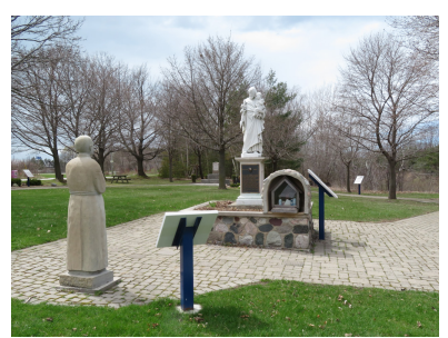
St. Joseph Heritage Park @ Hwy. 21 & Zurich-Hensall Road, St. Joseph

Q: What is one native plant found in this garden?