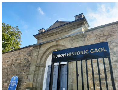
Huron Historic Gaol 181 Victoria St. N., Goderich

Q: What is the hashtag found at the bottom of the Gaol selfie station?