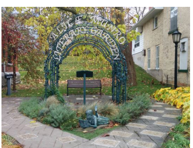
Alice Munro Literary Garden

273 Josephine St., Wingham O: What book is the statue of the young girl in the garden reading?