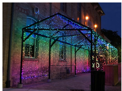
Light Tunnel 23 Albert St., Clinton

Q: What was the message at the end of the tunnel?