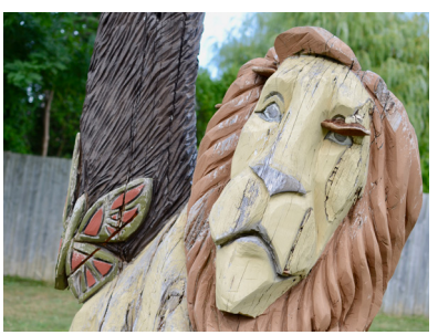
Lions Harbour Park West & Harbour St., Goderich

Q: What category of tornado struck Goderich?