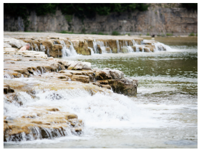
Your pick! Share your favourite spot from anywhere in Huron County

Q: What was your favourite piece of artwork currently on display at the gallery?